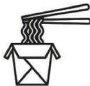
Instan Noodle Soup