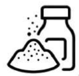
Extract & Extract Powder